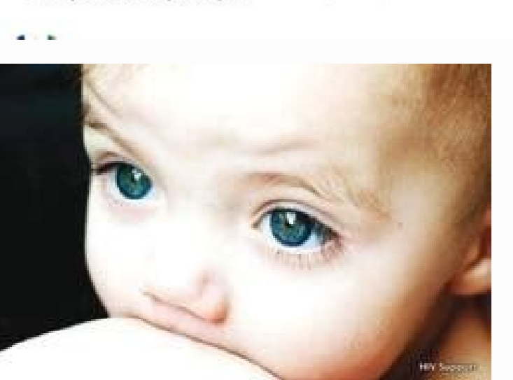
Table and Figures

METHODS We conducted a 96-week open label randomised trial in South Africa, comparing TAF/FTC/DTG, TDF/FTC-DTGT and TDF/FTC/EFV. N = 1053 ART-naïve PLWH. Inclusion criteria: age 18-24 years, no prior ART > 30 days, creatinine clearance > 60 mL/min (> 80 mL/min if < 19 years) and HIV-1 RNA > 500 copies/mL. Exclusion criteria: pregnancy or tuberculosis at screening or assessment visits. No screening for baseline resistance (as per South African treatment guidelines). Primary treatment failure endpoints: 48-week HIV-1 RNA > 50 copies/mL, discontinuation or missing data (TC was inferiority margin < 20%, significance level p < 0.017, adjusted for multiple comparisons). We report 48-week efficacy and safety data.